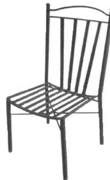
Ravello Chair £155